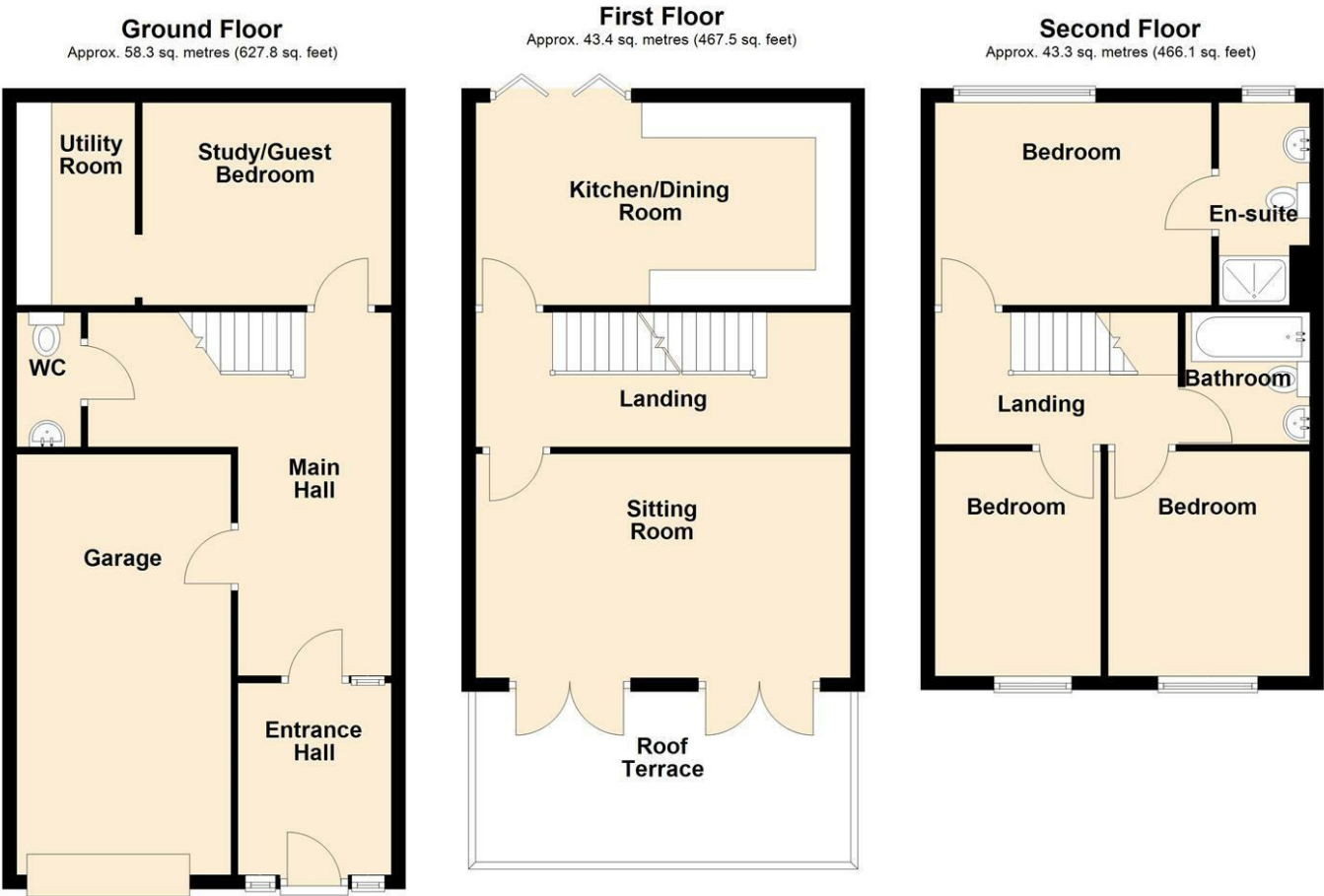
25 The Rise, Southwell